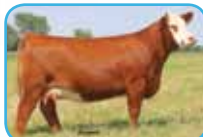
W/C Miss 4770 Full Sister to Lot 23