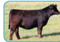
W/C RJ 8543 6112D Full Sister