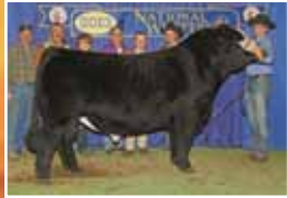
Mr. HOC Broker