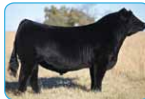
LLSF Pays To Believe ZU194 Embryo Sire

ASA#2476049 PB Dbl. Polled Black BD: 12-13-08