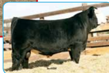
TLLC One Eyed Jack Full Sibling to Embryos

Seller guarantees one (1) pregnancy per package if implantation is performed by a certified embryologist.