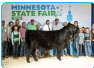
HS Cool Burn C16X $27,000 daughter