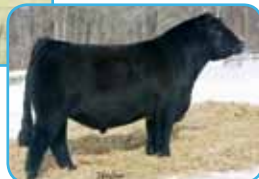
RGRS SRG Two Step 20Z ET Embryo Sire