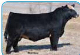
WS Stepping Stone B44 Embryo Sire

722T (Ellie) has cut a wide swath as a breed leading donor since being a many time champion, including being crowned NWSS Grand Champion Female at the Junior Show. "Ellie" 722T's first flush produced $106,000 in progeny sales for Griswold and she hasn't looked back with daughters topping the Diamond M Sale among many sales in Canada. The matings to Stepping Stone & Uprising are sure to impress with a fast ROI as "Ellie" 722T has been a no miss donor.