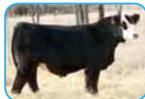
W/C Bullseye 3046A Embryo Sire