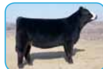
JSM/FVF Fistful of Glitter Z20 Daughter

ASA#2578309 1/2 SM 1/2 AN Dbl. Polled Black BD: 3-10-10 B C Lookout 7024 O C C Legend 616L Gibbet Hill Mignonne E37 HHSF Black Glitter PCC Night Moves H10 HHSF Black Matilda