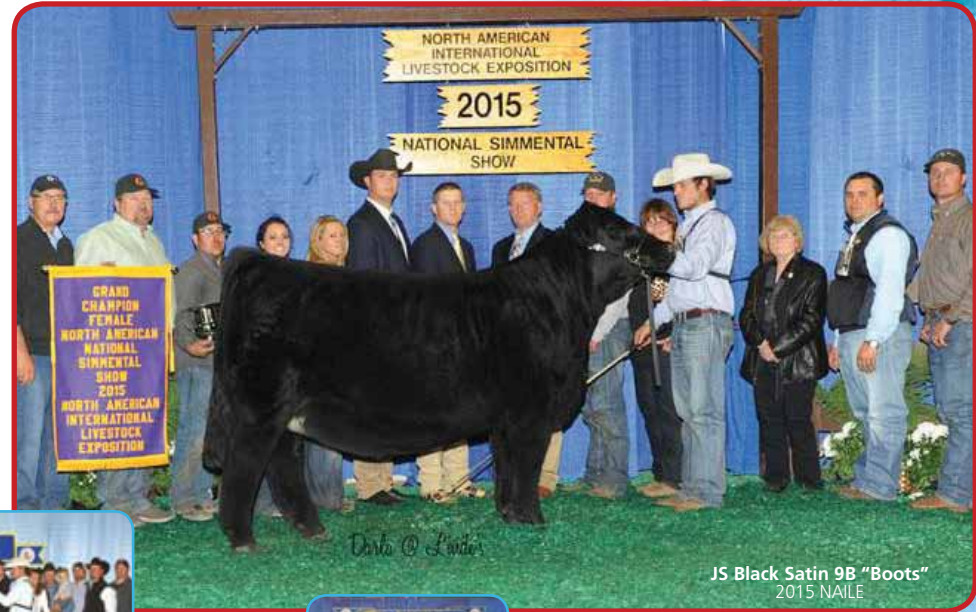
JS Black Satin 9B "Boots" 2015 NAILE

Sexed heifer embryos, your choice, out of the dam that produced the first ever Simmental female to win the Jr. National & the Triple Crown. We feel this mating with W/C Loaded Up will be a great match & the value of these heifer calves will be unlimited. The Broker embryos will be full siblings to the 2015-16 Triple Crown Winning Boots. Congratulations to Griswold Cattle & Campbell Land & Cattle and their success with JS Black Satin 9B (Boots)!