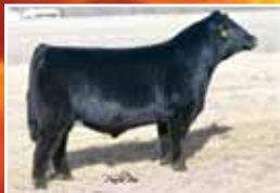
W/C BF Innocent Man