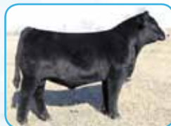
Mr. TR Hammer 308A ET Embryo Sire

Seller guarantees one (1) pregnancy per package if implantation is performed by a certified embryologist.