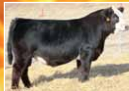
W/C Lock Down