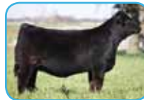
LLSF Bella Daughter