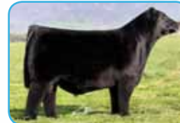
Colburn Primo 5153 Embryo Sire