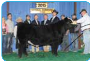
CAJS Blaze Of Glory Embryo Sire