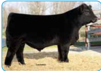
STF Royal Affair Z44M Embryo Sire