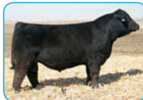
CCR Cowboy Cut 5048Z Embryo Sire