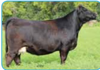
Hook's Bella B72