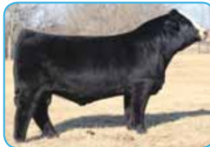
TKCC Classified Embryo Sire