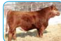
W/C All In 770A Son of KS Miss Sequoia Y770

ASA#2660685 3/4 SM 1/4 AR Homo. Polled Red BD: 4-11-11