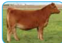
HILB/Jass Fallin In Love 56D $17,500 Daughter