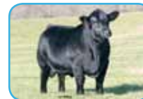
LLSF/VLF Reactor Son