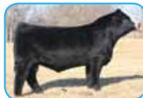
TKCC Classified Embryo Sire