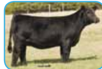
Daughter of 722T

RANCIER FARMS, MUIRHEAD CATTLE & CANADIAN DONORS