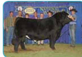
Mr. HOC Broker Embryo Sire