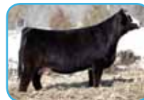
LLSF Eye Candy Daughter