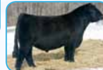
RGRS SRG Two Step 20Z ET Embryo Sire