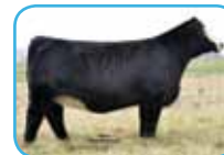
LLSF Amethyst Daughter