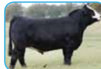
SNF Magnolia's No Contest Son