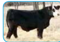
W/C Bullseye Full Brother to Donor