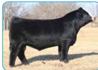
TKCC Classified Embryo Sire

Seller guarantees one (1) pregnancy per package if implantation is performed by a certified embryologist.