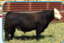
W/C Loaded Up 1119Y Embryo Sire

Seller guarantees one (1) pregnancy per package if implantation is performed by a certified embryologist.