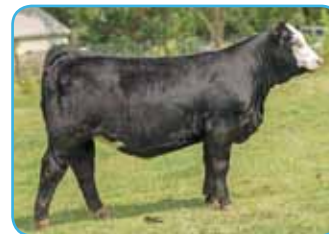
SS Enchantress B200 $33,000 1/2 Interest Daughter