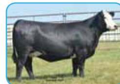
ACW Annie K 330Y Donor's Dam