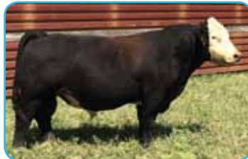
W/C Loaded Up 1119Y Embryo Sire