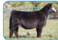
LLSF Baby Steel Daughter