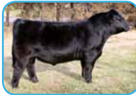
LHT Making Tracks $38,000 Valuation Son