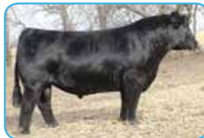
TJ High Calibre 556B Embryo Sire