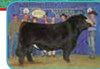
Mr. HOC Broker Embryo Sire