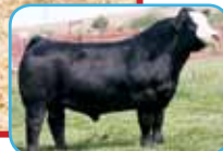
Remington Secret Weapon 185 Embryo Sire