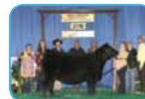
Miss CCF Jestress C12 Full Sibling to Ignition x Jestress 9015 Embryos, Reserve Champion Percentage in the Junior Show 2016 NAILE