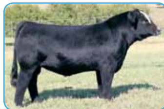
Mr. CCF Vision Embryo Sire

Real-Time Bidding is available via Internet for this sale!