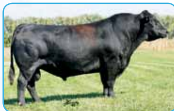
MCM Top Grade Embryo Sire

Seller guarantees one (1) pregnancy per package if implantation is performed by a certified embryologist within one(1) year.