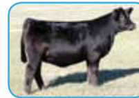
W/C RJ 8543 5057C Full Sister