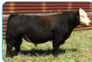
W/C Loaded Up 1119Y Embryo Sire