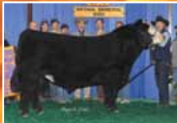
STCC Jacked Up