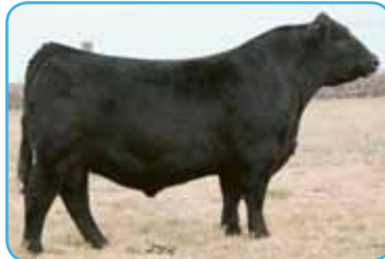
W/C Executive Order 8543B Embryo Sire