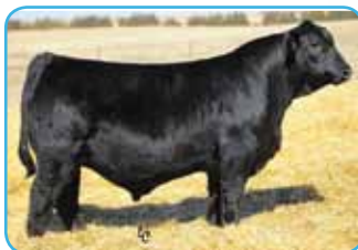
CCR Wide Range 9005A Embryo Sire