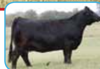
SNF Magnificent Magnolia Daughter