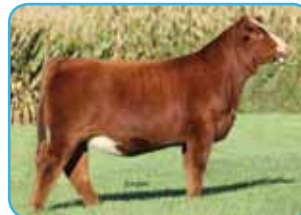
RHJ2 Royal Uprising D04 $7,000 Daughter