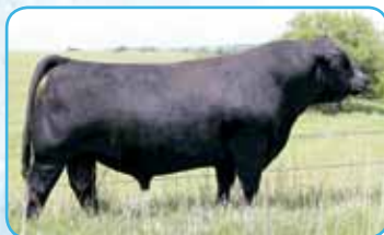
WS Pilgrim H182U Embryo Sire

Seller guarantees one (1) pregnancy per package if implantation is performed by a certified embryologist.