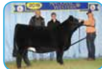
K-LER Barbie 455B

Here is a chance to buy POPULAR, FRESH GENETICS from a UPCOMING HOT COW LINE crossed with two influential herd sires. K-LER Barbie was purchased for $20,000 in last year's "The One" Sale. She has turned into the big massed, easy keeping, eye appealing donor we expected. Barbie is a maternal sister to K-LER Kingsman and K-LER Dolly's Queen who are features in this year's Denver sale (both sired by Executive Order). Barbie's dam was the $21,000 Gateway herd pick from the 2012 Denver sale. Barbie's sire K-LER Young Money was a 2-time Denver Division Champion (calf & 2 year old), and he is a son of the past Denver Champion, Denver high seller, K-LER Sweetness. These embryos are potentially the fourth generation of Denver high sellers.