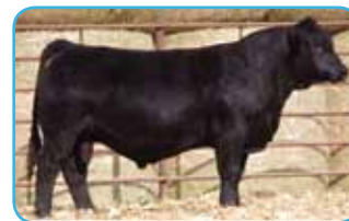
Sandeen Deep Impact $9000 full brother in blood to Sandeen Upper Class