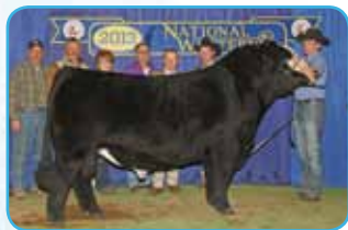
Mr. HOC Broker Embryo Sire

Seller guarantees one (1) pregnancy per package if implantation is performed by a certified embryologist.