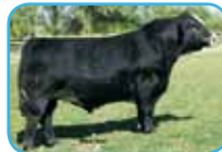
JF Milestone 999W Embryo Sire