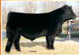
STF Royal Affair