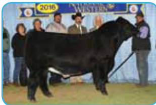
MAC Wall Street 2016 NWSS Grand Champion Bull & 2016 Dixie National, Full Sibling to Embryos