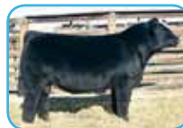
WLE Big Deal A617 Embryo Sire

ASA#2598794 1/2 SM 1/2 AN Dbl. Polled Black BD: 2-10-11 WSJ Encore CNS Dream On L186 TC Bandeva 0118 MCM 505R MCM Marbler 307N MCM 312N