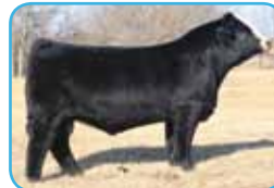
TKCC Classified Embryo Sire