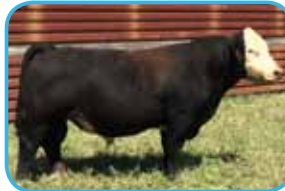
W/C Loaded Up 1119Y Embryo Sire