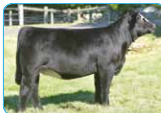
HPF BK AF Knockout 267C Daughter