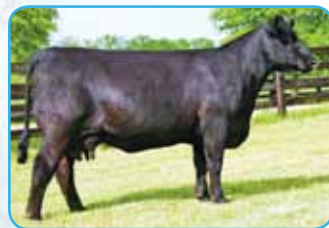
JAS Jestress 9015 Dam

Seller guarantees one (1) pregnancy per package if implantation is performed by a certified embryologist.