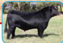
Mr. CCF 20-20 Embryo Sire