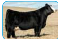
SSC Victoria's Secret 49B Daughter