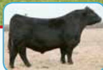
W/C Executive Order Embryo Sire

Seller guarantees one (1) pregnancy per package if implantation is performed by a certified embryologist.