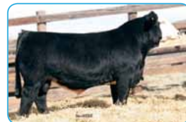
Long's Shear Pleasure Embryo Sire

We look forward to seeing you on Saturday evening on January 14th! Selling elite embryos and rare semen from the nation's top breeders!