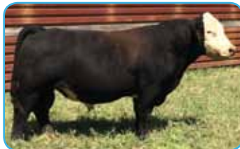
W/C Loaded Up 1119Y Embryo Sire