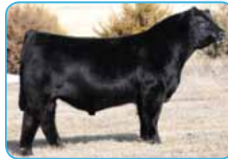
W/C Relentless 32C Yardley Utah x Miss Werning KP 8543U