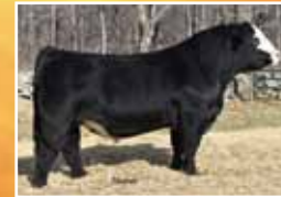
HPF Rock Star