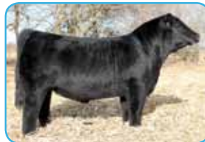
Profit Embryo Sire