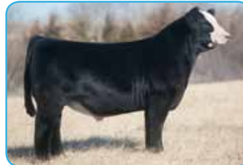
WS Revival Embryo Sire