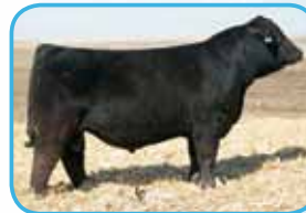
CCR Cowboy Cut 5048Z Embryo Sire