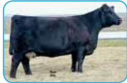
WLE Missy Y409 770P Daughter

These embryos are full siblings to Shawnee Miss 770P. This great donor has produced WLE Missy U409, WLE Uno Mas, WLE Swagger, WLE Big Deal A617 among others.