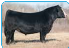
LLSF Uprising Z925 Embryo Sire