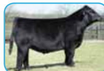
GSC/LTS Payday 93C Full sibling to Pays To Believe Embryos