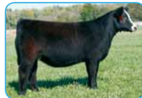
$25,000 Daughter of Miss USA