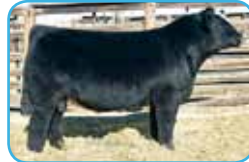
WLE Big Deal A617 770P Son