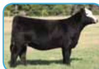
Daughter of 722T