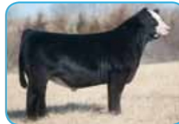
WS Revival Embryo Sire