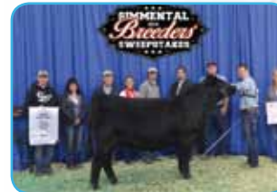
Daughter of X505 Maternal Sib in Blood

Real-Time Bidding is available via Internet for this sale!