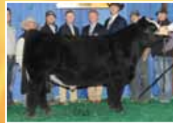
CAJS Blaze Of Glory