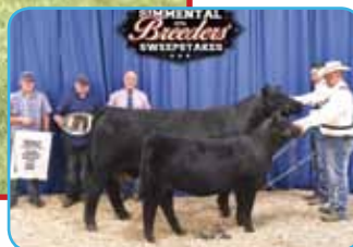
Z227 as Champion Cow/Calf Pair 2016 Simmental Breeders Sweepstakes