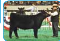
SVF Image Z202 $55,000 Daughter