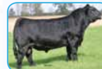
CARD Uproar 49Y Embryo Sire