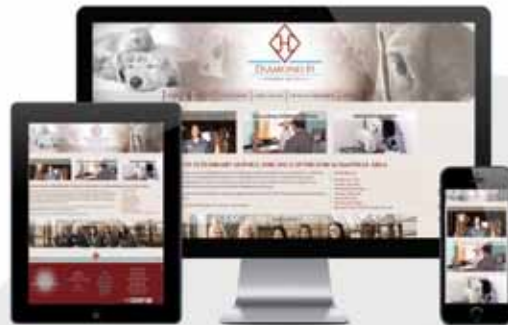
Custom & Responsive Websites