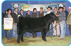
WLE Swagger 770P Son