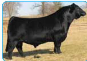
TNGL Grand Fortune Embryo Sire