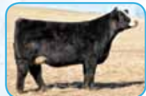
SSC Miss Cool Butt 26A Fatt Butt Daughter

Seller guarantees one (1) pregnancy per package if implantation is performed by a certified embryologist.