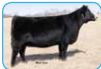
JBS Rockin Robin Donor's Dam