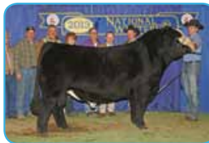
Mr. HOC Broker Embryo Sire