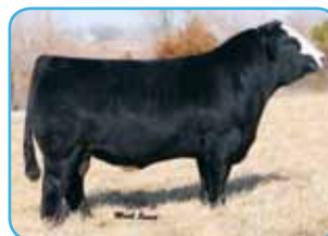
Combustible Full Sibling to Embryos