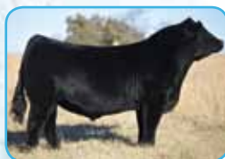
LLSF Pays To Believe ZU194 Embryo Sire

Seller guarantees one (1) pregnancy per package if implantation is performed by a certified embryologist.