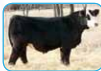
W/C Bullseye 3046A Embryo Sire