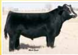
WS A Step Up