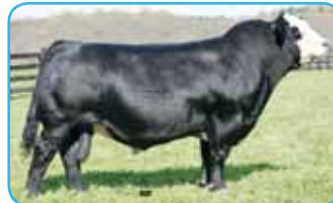
Remington Lock N Load 54U Embryo Sire