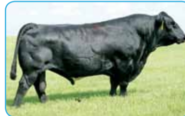
SS Goldmine L42 Embryo Sire