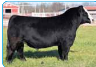
HILB Oracle C033R Embryo Sire