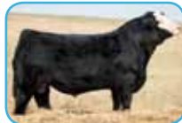
SSC Shell Shocked 44B Full Sibling to Lot 25 Embryos