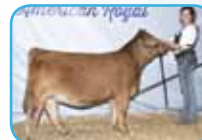
HILB/Jass Order Me Roses $15,000 Daughter