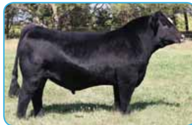
Mr. CCF 20-20 Embryo Sire

Seller guarantees one (1) pregnancy per package if implantation is performed by a certified embryologist.