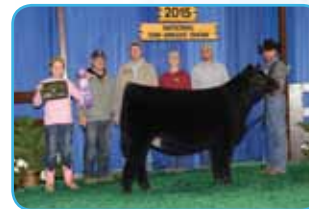
$24,000 Full Sister to Embryos