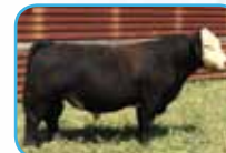
W/C Loaded Up 1119Y Embryo Sire

JS SIMMENTAL Jay Steenhoek, Prairie City, IA 515-238-5938