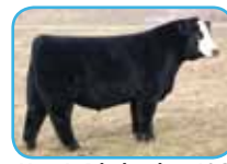
Hara's Distinction 10C Embryo Sire