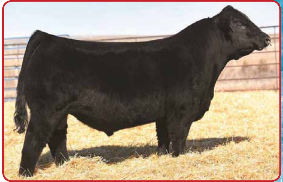
2016 NWSS Champion Pen – Carver was the lead off bull

Carver was the $34,000 high selling bull in the Kearns Cattle Company Bull Sale. He was the lead off bull in the 2016 National Western Stock Show Grand Champion Pen of Three Simmental Bulls. He offers an unsurpassed look of balance and stoutness with a flawless build. His dam, Dolly, has become a household name due to her ability to generate multiple 5-figure her sire prospects from an array of matings. He will stamp his progeny with his unprecedented three-dimensional look. This is the first sexed female semen being offered for sale.