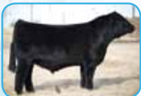
Ruby SWC Battle Cry 431B Embryo Sire

ASA#2884112 PB Homo. Polled Homo. Black BD: 3-24-14