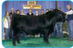
WLE Uno Mas 770P Son