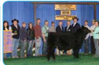
HILB Oracle C033R Embryo Sire