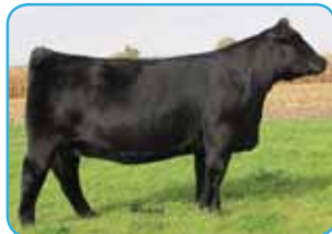
HSF Jezebel B402 $25,000 Full Sister to Donor