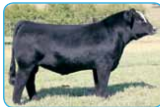
Mr. CCF Vision Embryo Sire