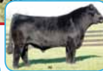
Packin Heat Son