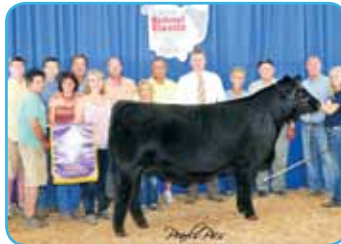
HF Serena Donor's Dam