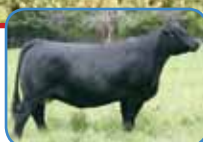
Aubreys Black Blaze III Dam