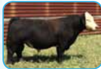
W/C Loaded Up 1119Y Embryo Sire