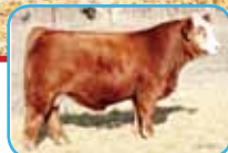
W/C HOC HCC Red Answer 33B Embryo Sire