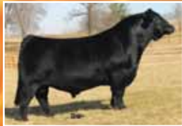
TNGL Grand Fortune