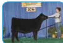
HILB/JLC Impress Me D211 $25,000 Daughter