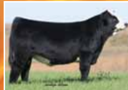
Longs The Player