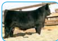
TLLC One Eyed Jack Embryo Sire