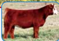
Daughter by KS Ms Sequoia