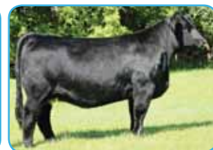
HS Cool Baby C38Z $23,000 daughter