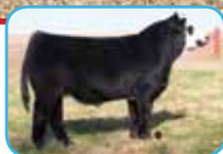
SFI Brickyard D20 Full Sib to Embryos