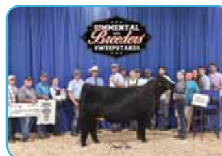
Miss CCF Jestress B79 Full sibling to Embryos