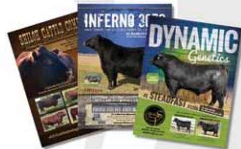
Business Cards, Flyers & Publication Advertisements