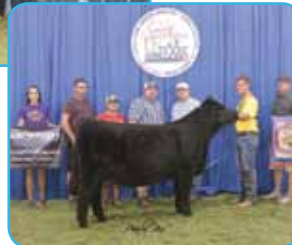
JS Black Satin 9B "Boots" Junior Nationals