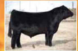
Ruby SWC Battle Cry