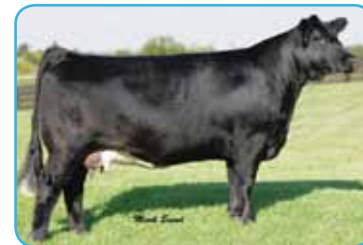
KenCo Miley Cottontail Donor's Dam