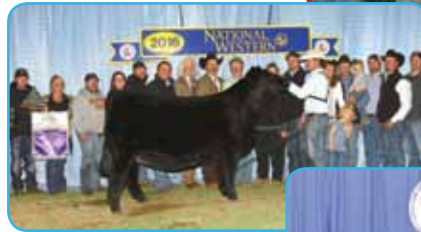
JS Black Satin 9B "Boots" 2015 NWSS