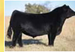
LLSF Pays To Believe