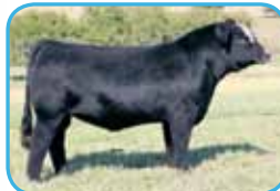
Mr. CCF Vision Embryo Sire