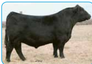
W/C Executive Order 8543B Embryo Sire