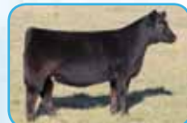
W/C Miss Sequoia 6073D Full Sister to Lot 23