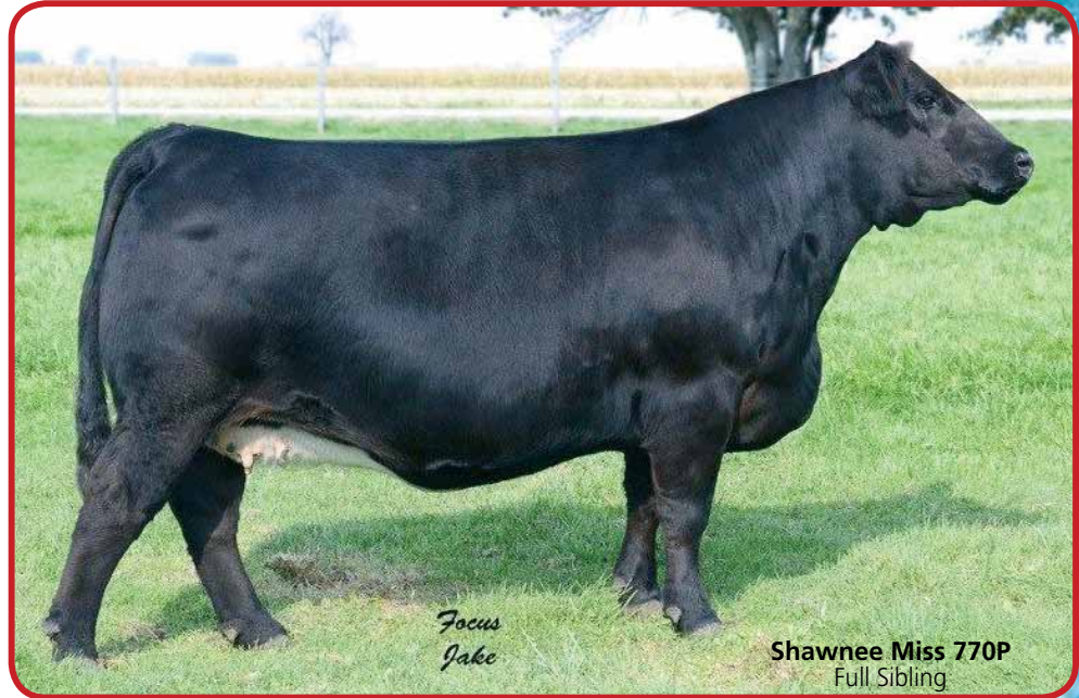
Shawnee Miss 770P Full Sibling