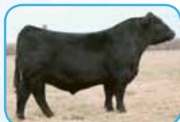
W/C Executive Order 8543B Embryo Sire

Seller guarantees one (1) pregnancy per package if implantation is performed by a certified embryologist.