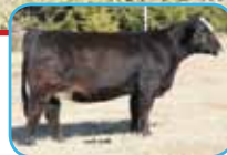
Daughter of 722T