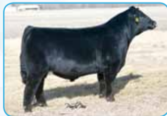
W/C BF Innocent Man Embryo Sire

Seller guarantees one (1) pregnancy per package if implantation is performed by a certified embryologist.