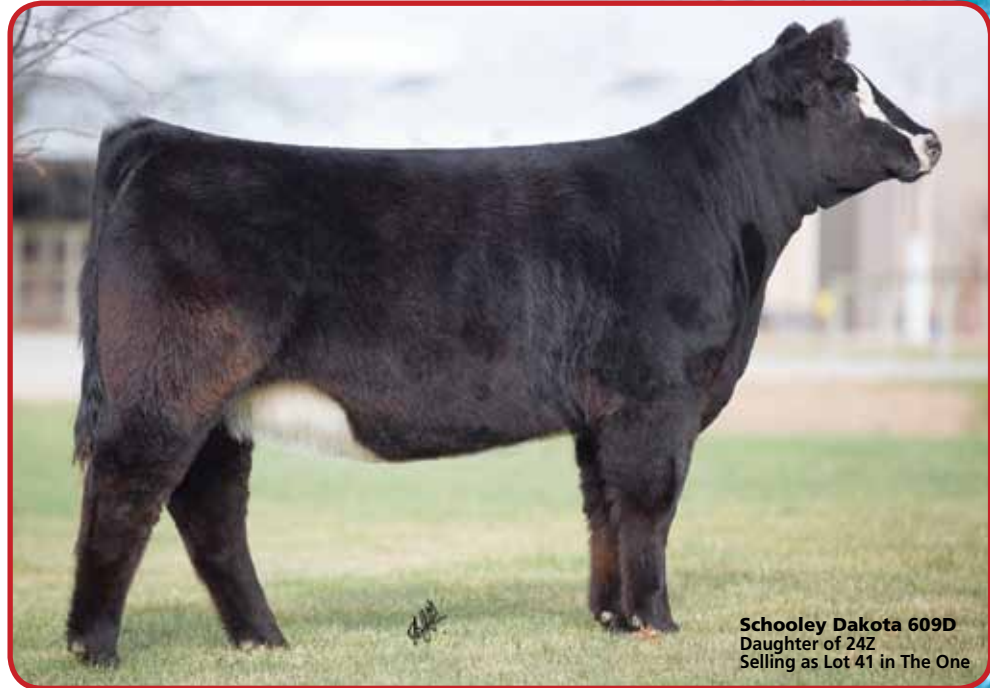
Schooley Dakota 609D Daughter of 24Z Selling as Lot 41 in The One