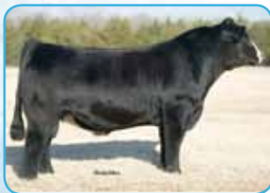
SVF Steel Force S701 Embryos Sire

Seller guarantees one (1) pregnancy per package if implantation is performed by a certified embryologist.