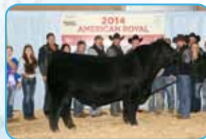
HPF Quantum Leap Z952 Embryo Sire

Seller guarantees one (1) pregnancy per package if implantation is performed by a certified embryologist.