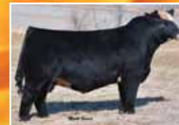
WS Stepping Stone