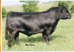
Yardley High Regard