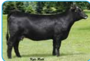
Hara's Miss Broker 24Z Donor