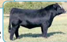
Mr. CCF Vision Embryo Sire