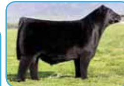
Colburn Primo 5153 Embryo Sire