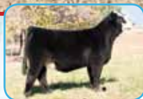
SFI Seein Purple Full Sib to Embryos

Seller guarantees one (1) pregnancy per package if implantation is performed by a certified embryologist.