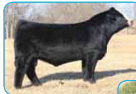
TKCC Classified Embryo Sire