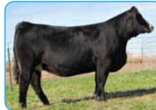
HSF Kendra C504 A top selling bred at the Jewels Of The Northland Sale