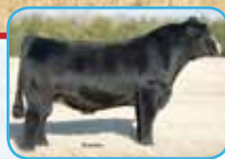
SVF Steel Force S701 Embryos Sire

Seller guarantees one (1) pregnancy per package if implantation is performed by a certified embryologist.