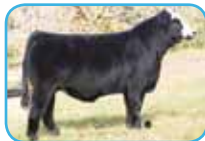
SFI Brigade D20 Full Sib to Embryos