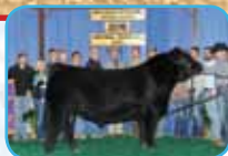
TL Bottomline Embryo Sire

Seller guarantees one (1) pregnancy per package if implantation is performed by a certified embryologist.