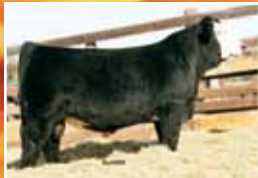
TLIC One Eyed Jack