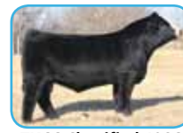
TKCC Classified 106C Embryo Sire