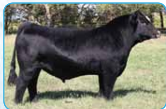
Mr. CCF 20-20 Full Sibling to Embryos

Seller guarantees one (1) pregnancy per package if implantation is performed by a certified embryologist.