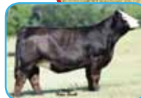
SNF Magnolia Blossom Daughter