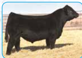
TKCC Carver 65C Embryo Sire

Seller guarantees one (1) pregnancy per package if implantation is performed by a certified embryologist.