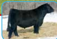
RGRS SRG Two Step Embryo Sire